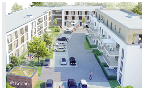
The Center for Care and Nursing Seidenhof Nettetal

m3connect's full rollout service required very little effort from KORIAN, which was a great relief for the head office. The head office only had to sign off on the process and inform each relevant facility about upcoming measures. From that point forward, m3connect took over all planning and the complete rollout with collaboration from each site. The head office was then informed about the results after each successful connection. The work on site was carried out under strict COVID-19 precautions