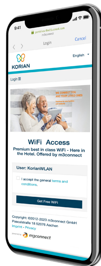
KORIAN's custom Wi-Fi portal.

The „Internet of Medical Things“ also plays a major role here. This includes devices that monitor vital resident data, support fall prevention systems, or operate nursing beds with assistance systems like stand-up aids or weight sensors.