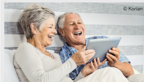
Digitalization enhances facility residents' quality of life.

KORIAN Group's German holding company is KORIAN Deutschland AG, which operates under the name KORIAN Deutschland. KORIAN Deutschland employs more than 23,000 people, and operates over 250 facilities with more than 27,000 inpatient care venues and around 3,000 assisted living apartments.